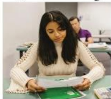
which impact mental health.

Majority of the students commonly expressed happiness with school life, which declined as students moved to secondary stage finds the "Mental Health and Well-being of School Students" survey by the National Council of Educational Research and Training (NCERT) on 3.79 lakh students from 36 States/UTs. The study also revealed that studies, examinations and results were major causes of anxiety for students.